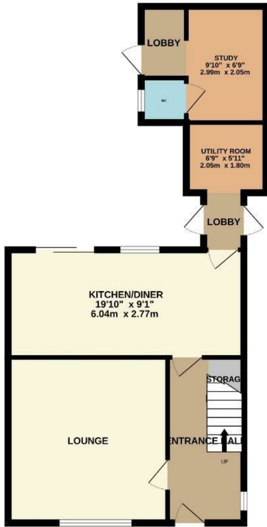
1ST FLOOR 461 sq.ft. (42.8 sq.m.) approx.